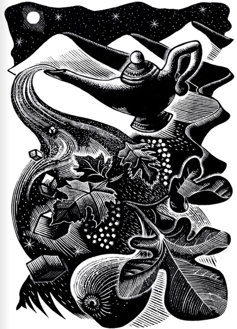
RON SANTIAGO DE CUBA 11 YEARS, JOHNNIE WALKER BLACK LABEL, CADELLO, MARSALA, FIG