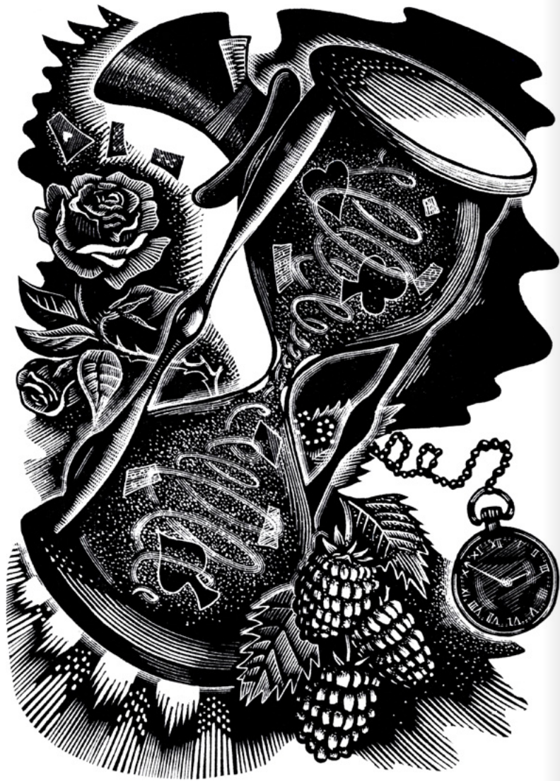
WHITLEY NEILL DISTILLED CUT GIN, ITALICUS, CHAMBORD, ACIDIFIED BERRIES

£26 / SHORT £16 NON-ALCOHOLIC WITH WITH AMARICO