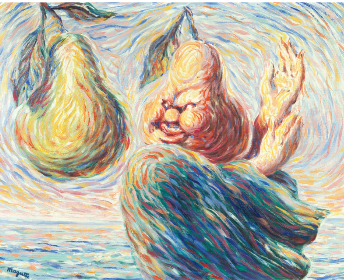
René Magritte, Le lyrisme , 1947. Le lyrisme , © Succession/Estate René Magritte - Sabam, Belgium, 2023.