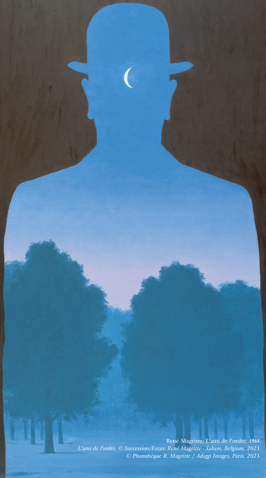
René Magritte, L'ami de l'ordre , 1964. L'ami de l'ordre , © Succession/Estate René Magritte - Sabam, Belgium, 2023.