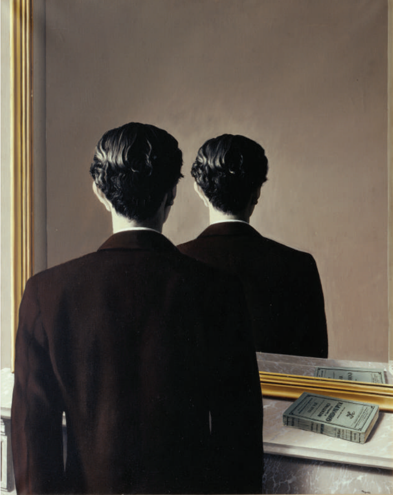
René Magritte, La reproduction interdite, 1937.

La reproduction interdite , © Succession/Estate René Magritte - Sabam, Belgium, 2023.