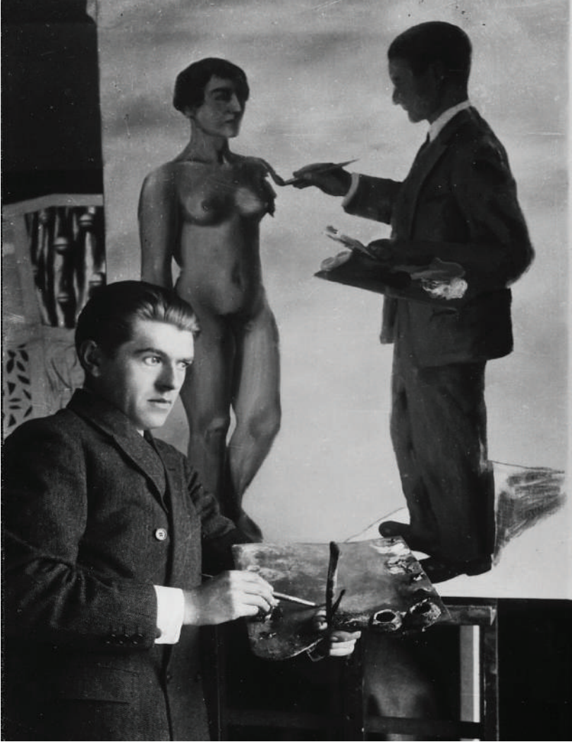
René Magritte, Magritte posant devant la "Tentative de l'impossible". Magritte posant devant la "Tentative de l'impossible" , © Succession/Estate René Magritte - Sabam, Belgium, 2023. © Photothèque R. Magritte / Adagp Images, Paris, 2023.