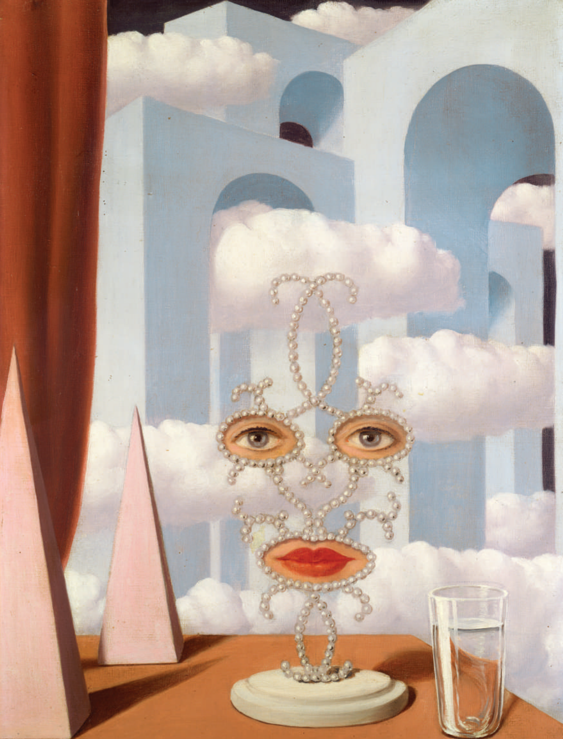
René Magritte, Shéhérazade , 1947. Shéhérazade , © Succession/Estate René Magritte - Sabam, Belgium, 2023.

Magritte