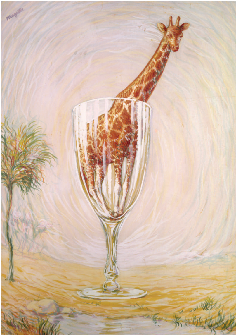
René Magritte, Le bain de cristal , 1946.

Le bain de cristal , © Succession/Estate René Magritte - Sabam, Belgium, 2023.