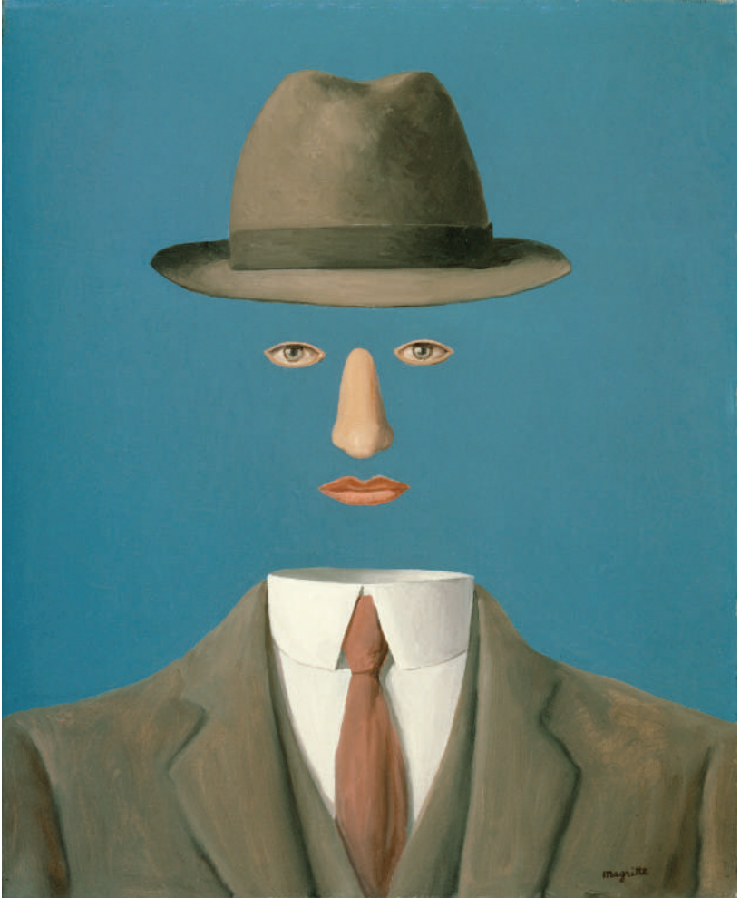
René Magritte, Le paysage de Baucis , 1966. Le paysage de Baucis , © Succession/Estate René Magritte - Sabam, Belgium, 2023. © Photothèque R. Magritte / Adagp Images, Paris, 2023.