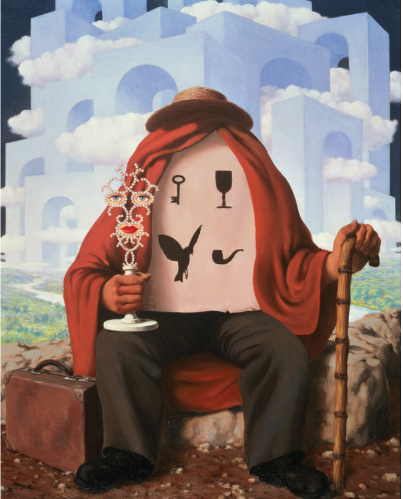
René Magritte, Le libérateur, 1947. Le libérateur