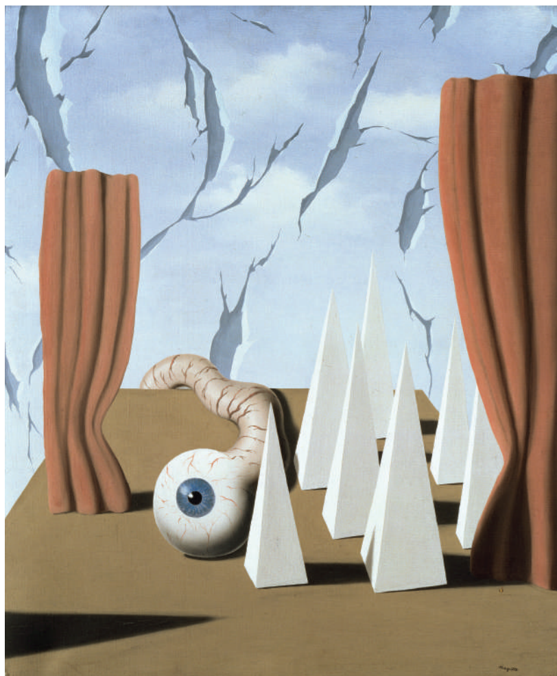
René Magritte, Le monde poétique , 1926.

Le monde poétique , © Succession/Estate René Magritte - Sabam, Belgium, 2023.