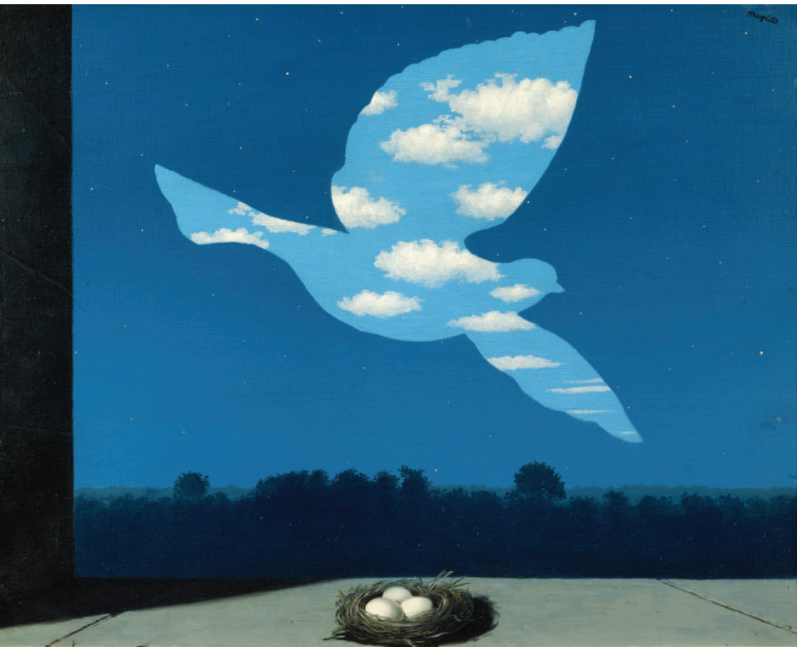
René Magritte, Le retour , 1940. Le retour , © Succession/Estate René Magritte - Sabam, Belgium, 2023.