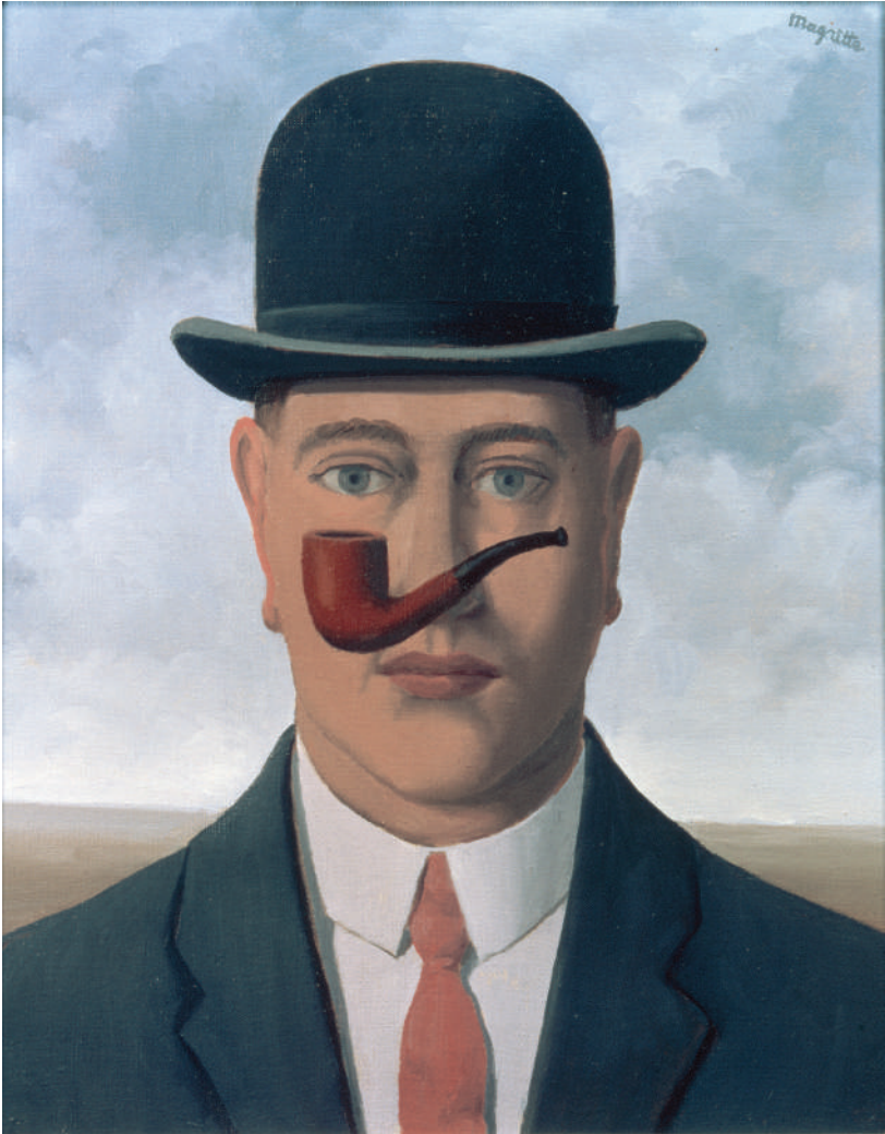
René Magritte, La bonne foi , 1965.

La bonne foi , © Succession/Estate René Magritte - Sabam, Belgium, 2023.