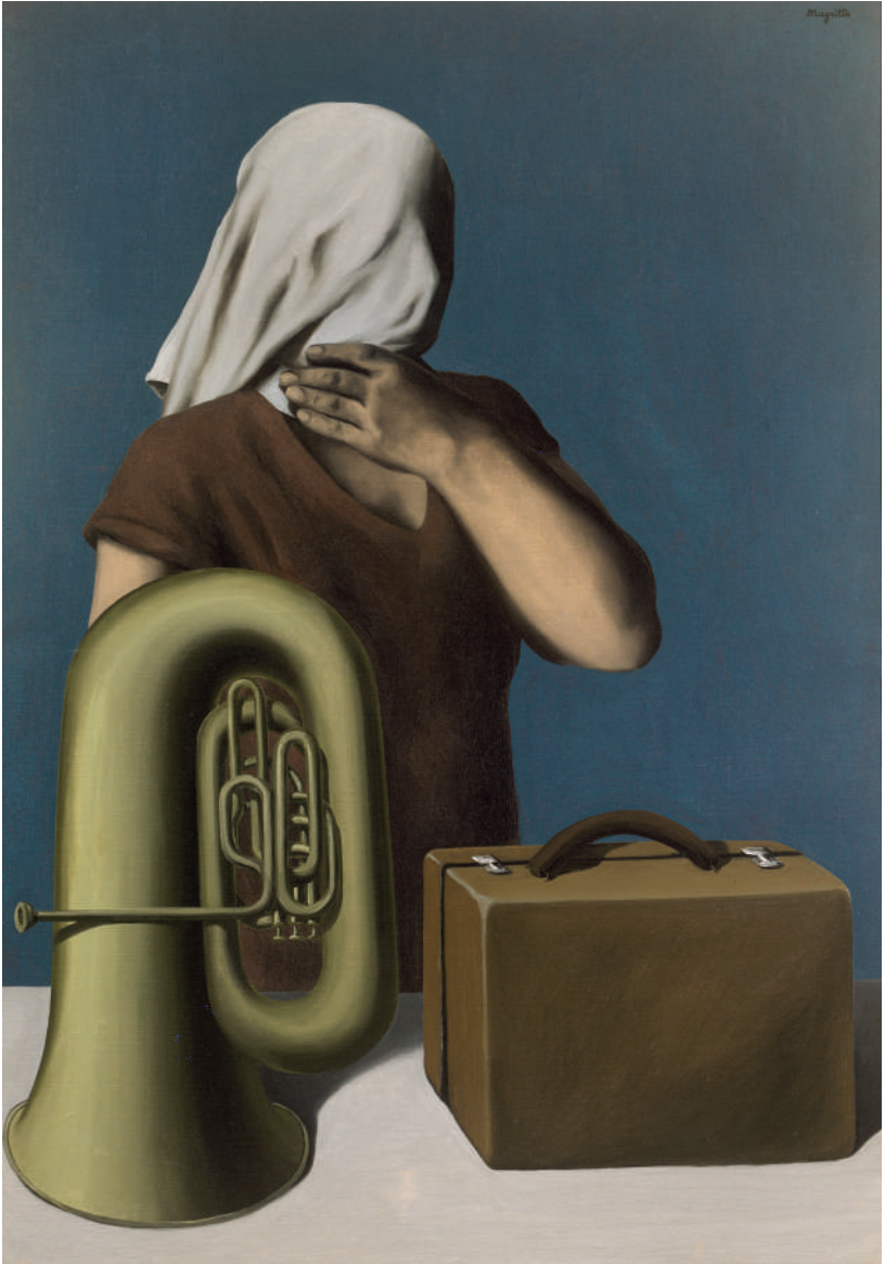
René Magritte, L'histoire centrale , 1928. L'histoire centrale , © Succession/Estate René Magritte - Sabam, Belgium, 2023.