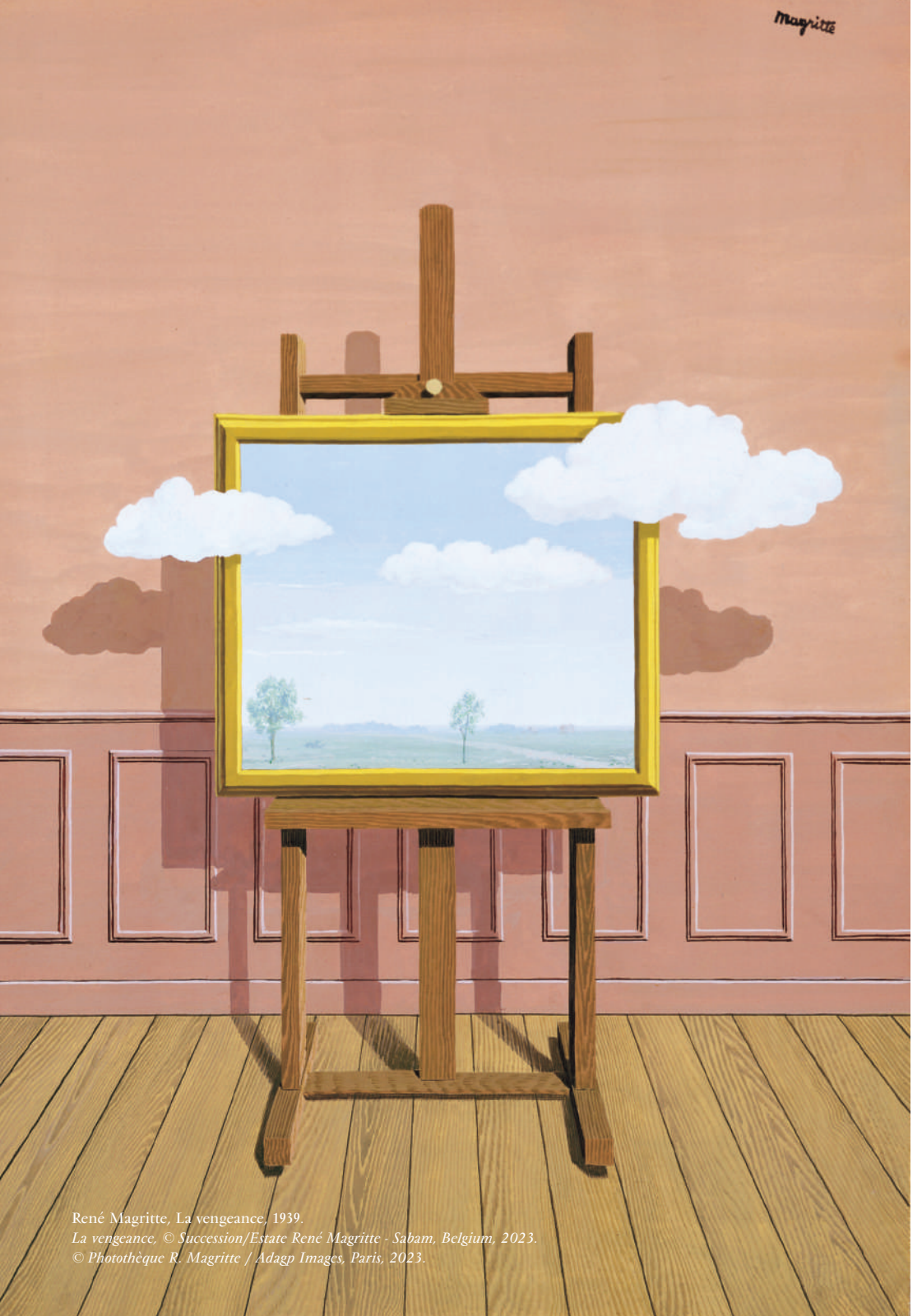
René Magritte, La vengeance , 1939. La vengeance , © Succession/Estate René Magritte - Sabam, Belgium, 2023.