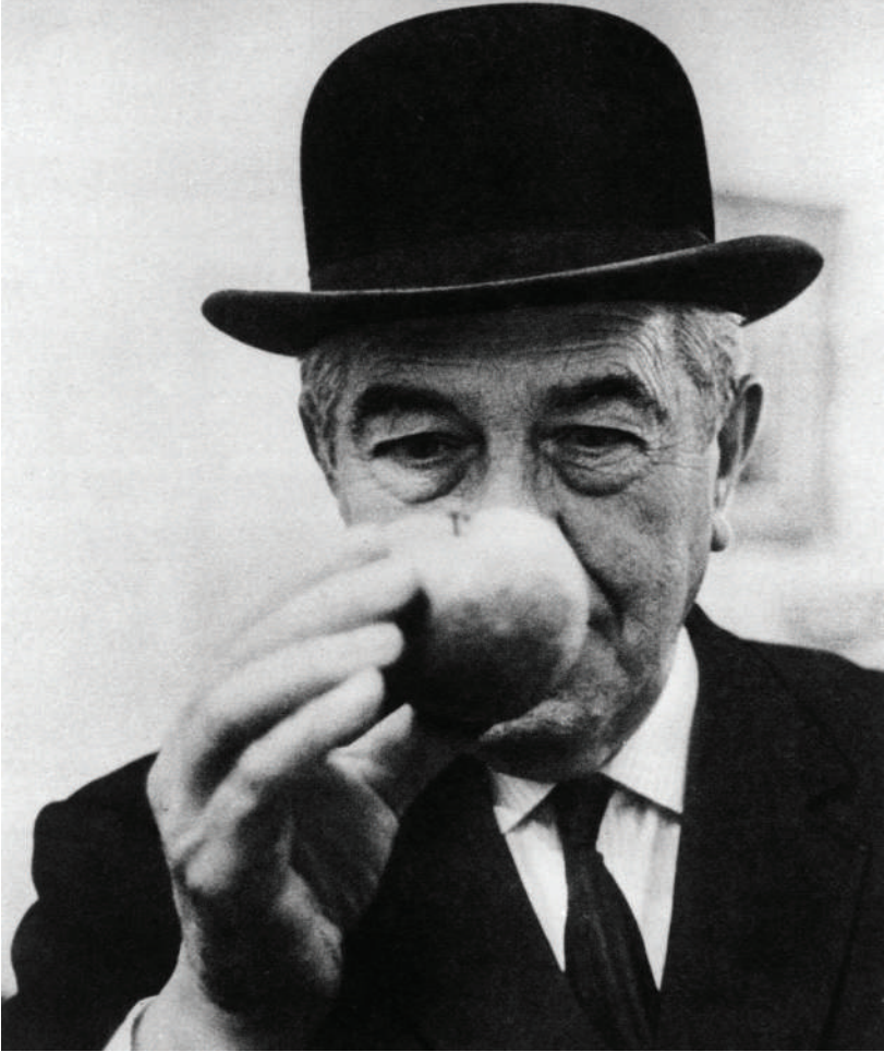
René Magritte, René Magritte à la pomme.

René Magritte à la pomme , © Succession/Estate René Magritte - Sabam, Belgium, 2023.