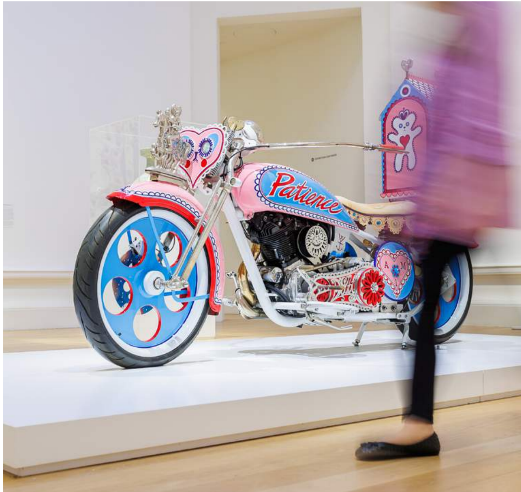
Grayson Perry, Kenilworth AM1, custom-built motorcycle, 2010