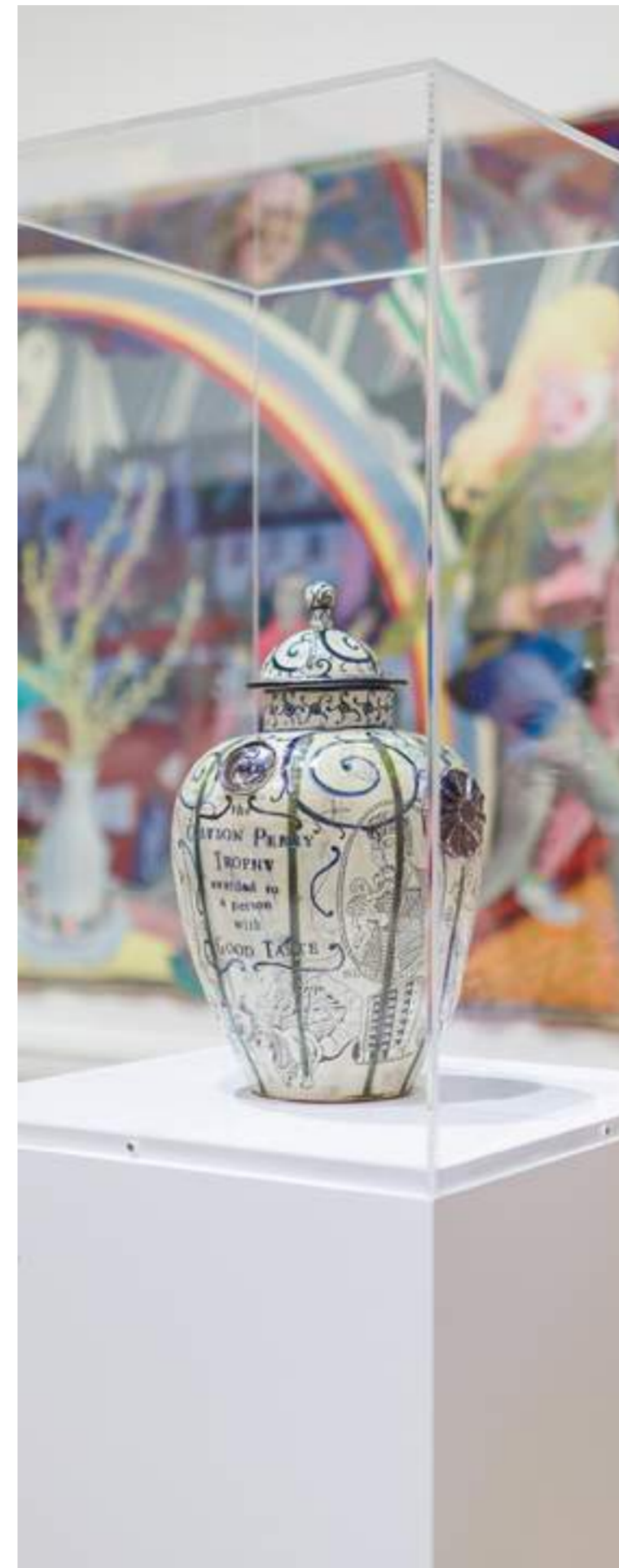
Grayson Perry Trophy Awarded to a Person With Good Taste, about 1992