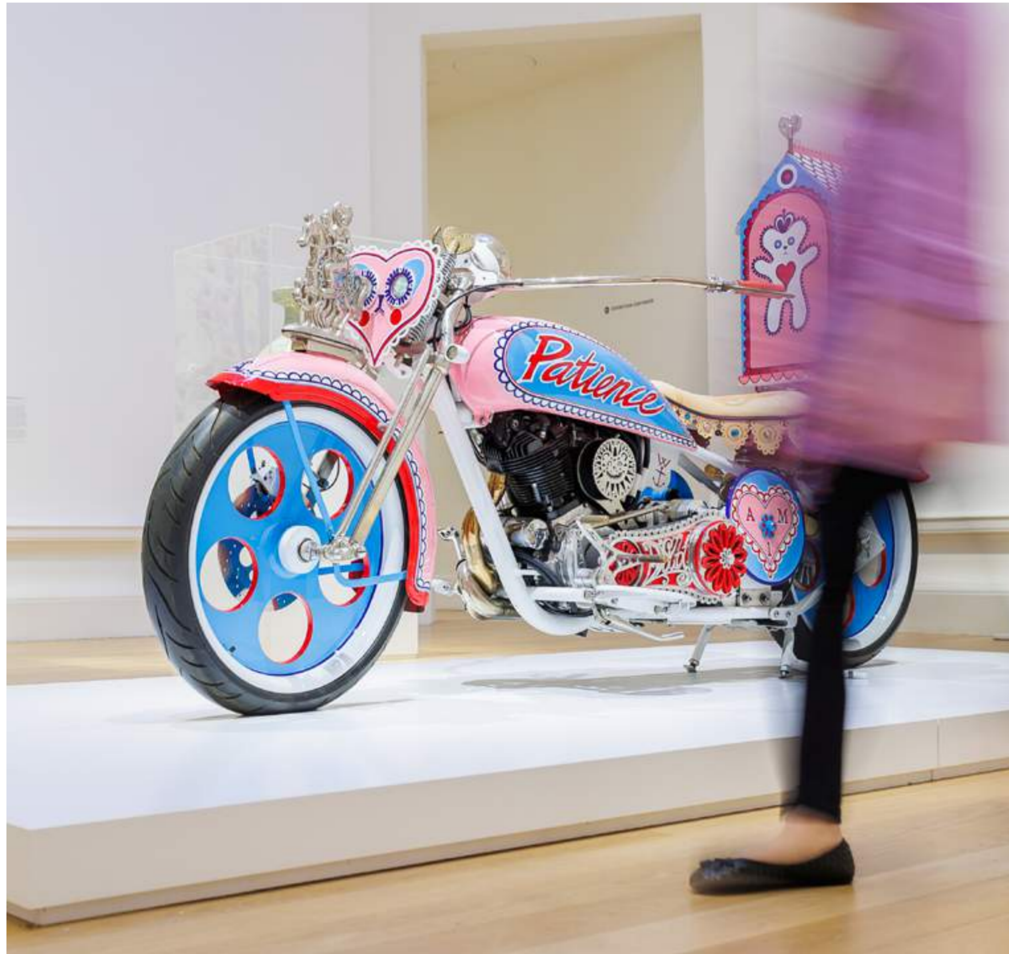
Grayson Perry, Kenilworth AM1, custom-built motorcycle, 2010