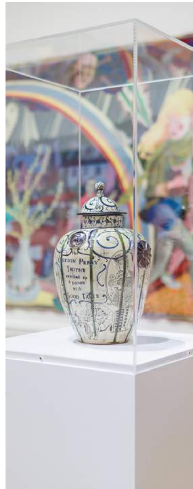
Grayson Perry Trophy Awarded to a Person With Good Taste, about 1992