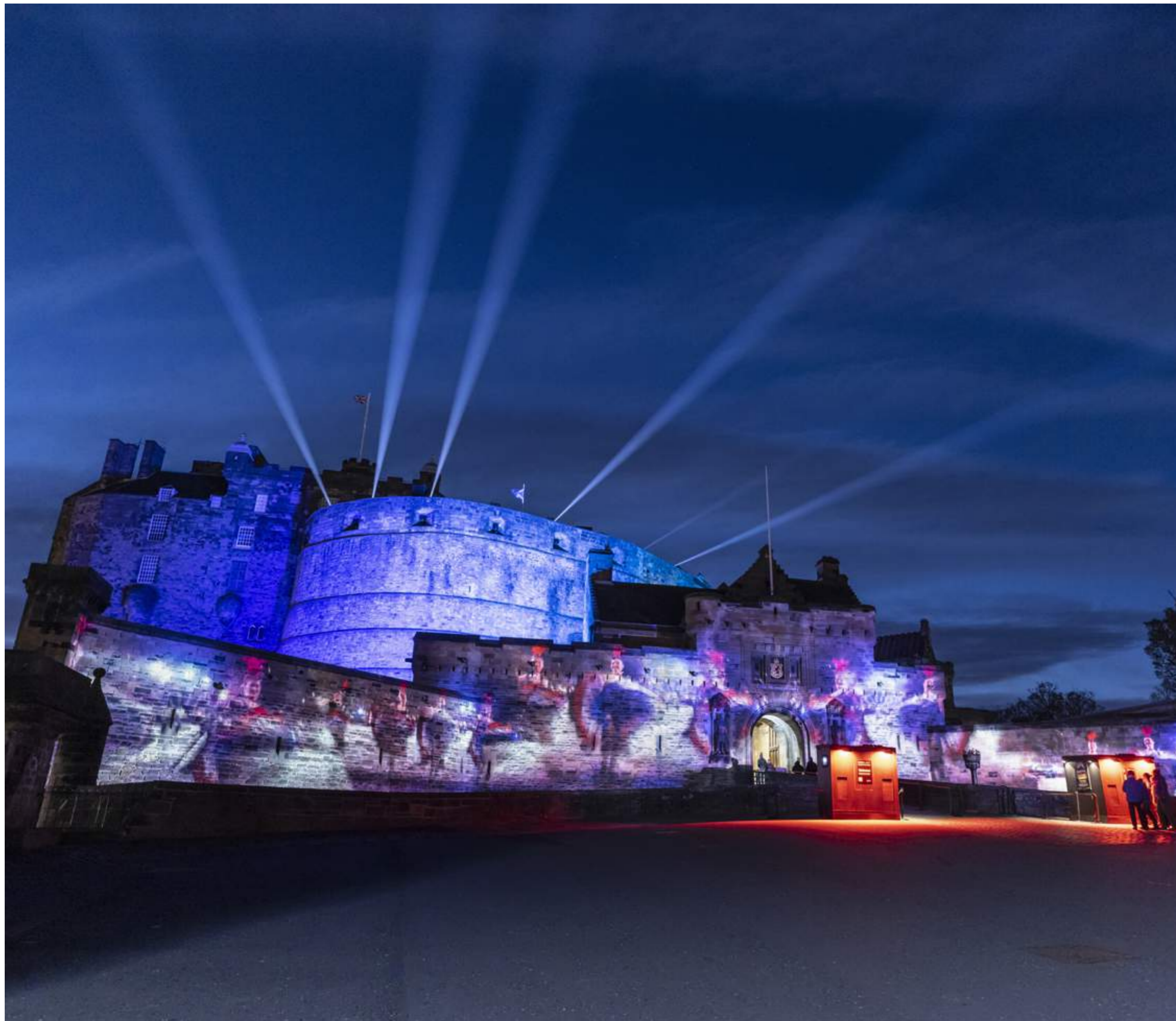
Edinburgh Castle, Castle of Light